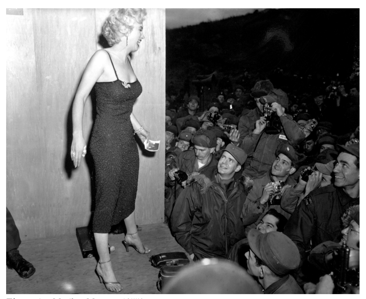
Figure 7 Marilyn Monroe, 1955^a