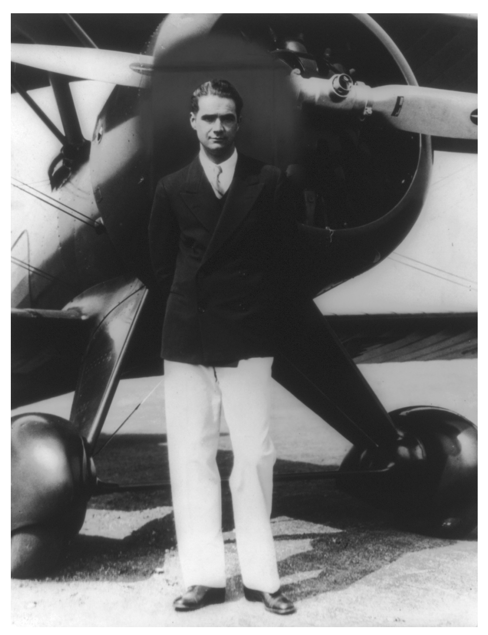
Figure 10 Howard Hughes, 1936